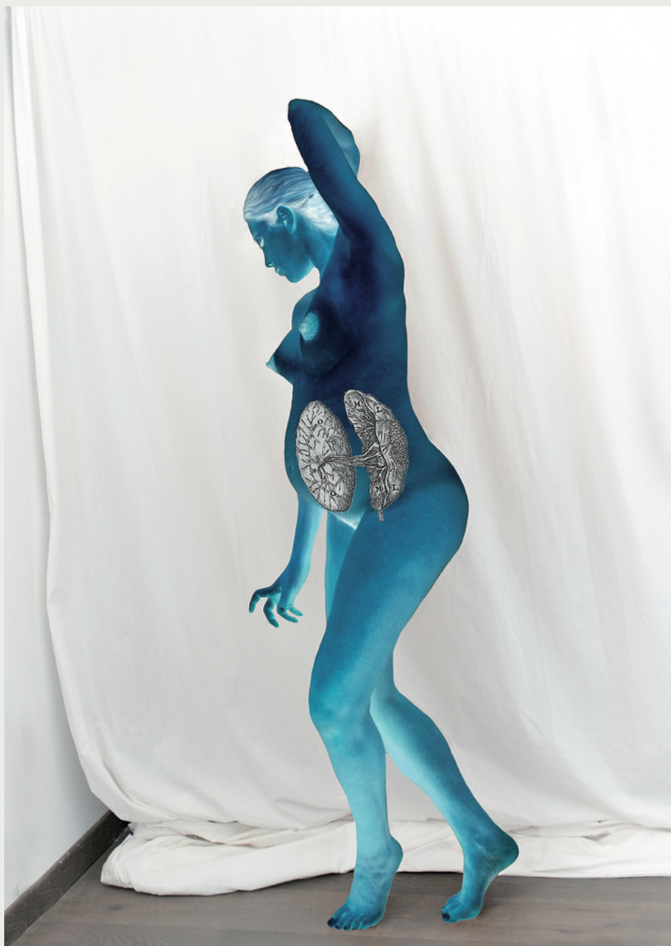
1 Medusa , from the series The Modern Spirit is Vivisectiva , 2014 © Francesca Catastini.

With photography made by Italian women from the 1960s to the present day, plus archival material and a photobook library, Collezione Donata Pizzi is niche but powerful. Words by Diane Smyth